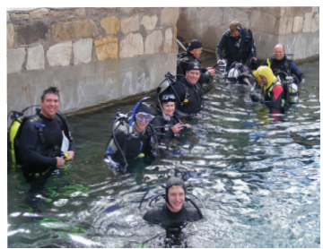
Scuba diving at the Blue Hole in New Mexico.

This project is being conducted with the cooperation of University of Arizona Cooperative Extension, City of Show Low, Town of Pine-top-Lakeside, Yellow Jacket Youth Center, and the USDA Forest Service-Kids in the Woods program.