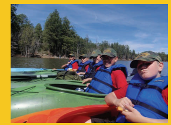
Playing it cool while flat-water kayaking.

See specific activity flyer posted online for greater detail about any activity.